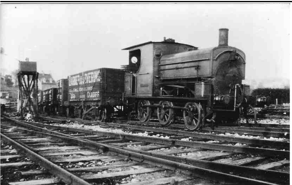
WC&P No. 3 off the rails at Portishead 31/12 1925 with Barker & Overing Colliery Agents Cardiff Wagon No. 259 behind the loco.

For anybody visiting the area, photos can be taken from Picow Farm Road, though the location is not ideal due to undergrowth and saplings restricting the view. This road passes under the rail bridge by Runcorn station and then over the link road between the M56 and Runcorn Bridge (where there is a junction with the link road). Just beyond the sidings is space to park off the road.