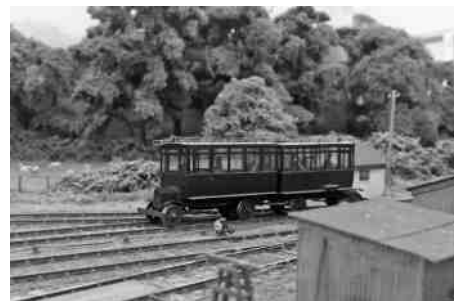
Two views of Les Darbyshire's stock operating Rye Town.

of vehicle the Colonel might have acquired had he still been with us in the 1990s - provided it was available at a good price.