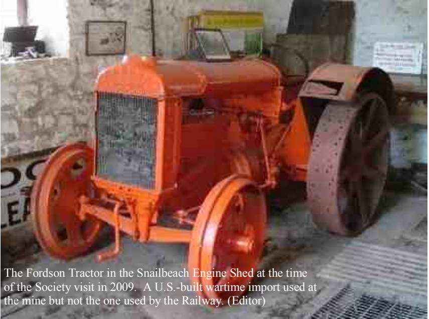
The Fordson Tractor in the Snailbeach Engine Shed at the time of the Society visit in 2009. A U.S.-built wartime import used at the mine but not the one used by the Railway. (Editor)