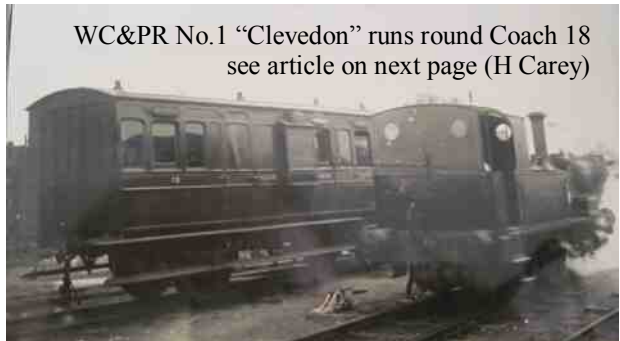
WC&PR No.1 "Clevedon" runs round Coach 18 see article on next page