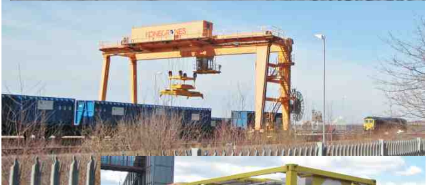
Above: Freightliner 66512 awaits its waste container train of empties at Weston Point Lt Rlwy Folly Lane sidings, 6 March 2015.