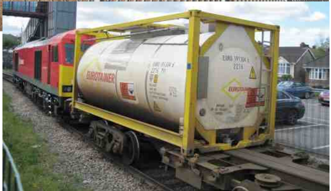
Right: DBS 60092 leaving Runcom Station and the Folly Lane Branch with caustic soda tank train, 28 April 2015.