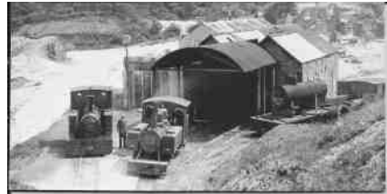
The Snailbeach Engine Shed in the 1920s with Skylark, Baldwin and Dennis's remains to the right. (Editor's Collection)

By the Second World War the only traffic