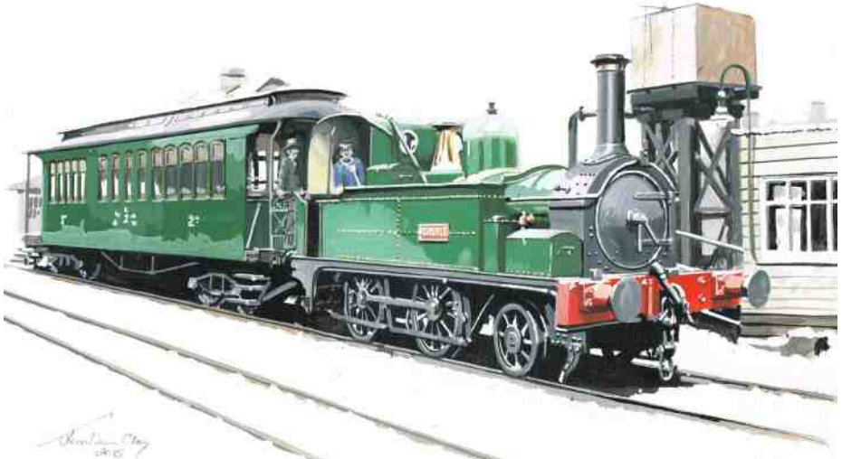
Our 2016 Christmas Card of WC&P Hesperus and American Coach. Below: A scene on Rye Town see page 18.