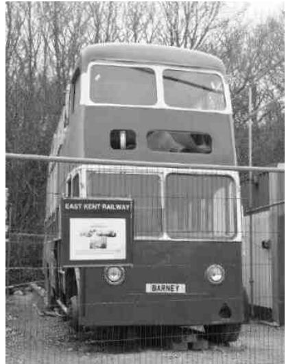
Barney March 15th (Callum Laing)

Dana Wiffen reports progress with their trolleybus project (which intrigued me at least when we visited last year): "Bradford